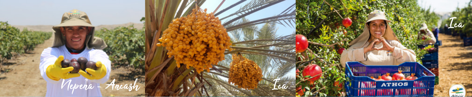
Nepeña - Ancash